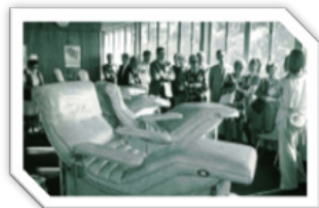
Comfy chairs await donors at a PGE blood drive in 1978.