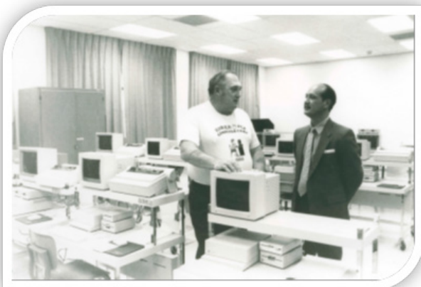
It wasn't THAT long ago, was it?